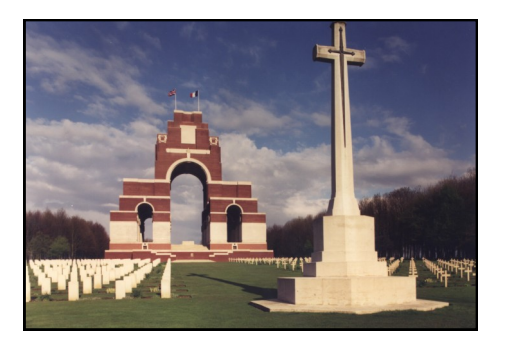
Thiepval Memorial, Somme, France

2340, 1st/5th Battalion, Gloucestershire Regiment Died aged 36 on 20 July 1916 Remembered with honour on Thiepval Memorial ; Pier and Face 5a & b Commemorated in Tewkesbury on the Grammar School Memorial