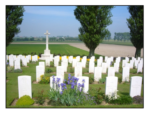
Klein-Vierstraat British Cemetery

13794. 8th Battalion. Gloucestershire Regiment Died aged 32 on 4 May 1918 Buried with honour at Klein-Vierstraat British Cemetery, Kemmel, Belgium; IV D 11 Commemorated in Tewkesbury at the Cross and in the Abbey