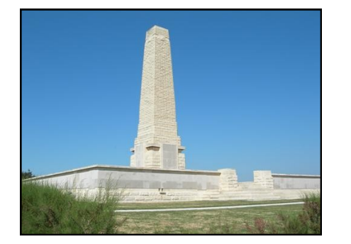
Helles Memorial, Turkey

PLY/16006, Plymouth Battalion, Royal Naval Division, Royal Marine Light Infantry Died aged 19 on 13 July 1915 Remembered with honour on Helles Memorial, Turkey ; Panel 2 to 7 Commemorated in Tewkesbury at the Cross