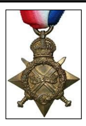
1914-15 Star Medal