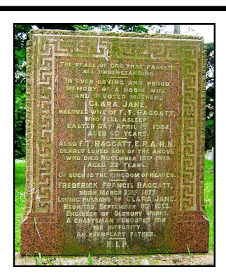
Raggatt Family Grave [D. Benson]

Died aged 22 on 18 November 1919 Not commemorated by CWGC, but buried in a family grave in Tewkesbury Borough Cemetery ; C-428 Commemorated in Tewkesbury at the Cross