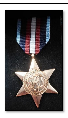
The Medal Received 2016