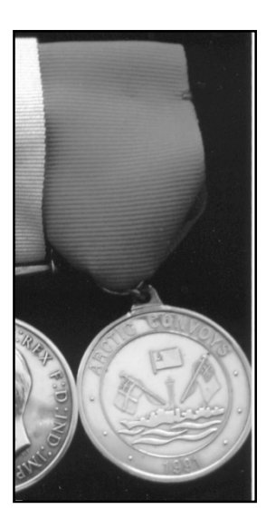
the "unofficial" medal, issued by the Russian Convoy Association