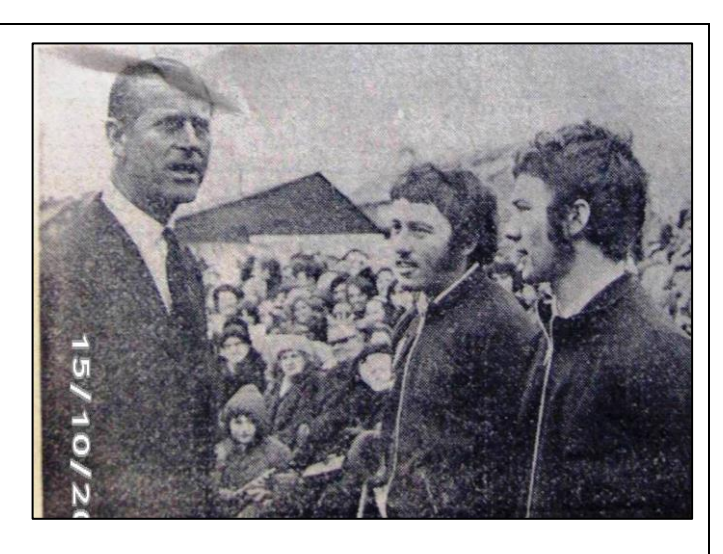
The photograph spoils his hair! With the lads at Cascades